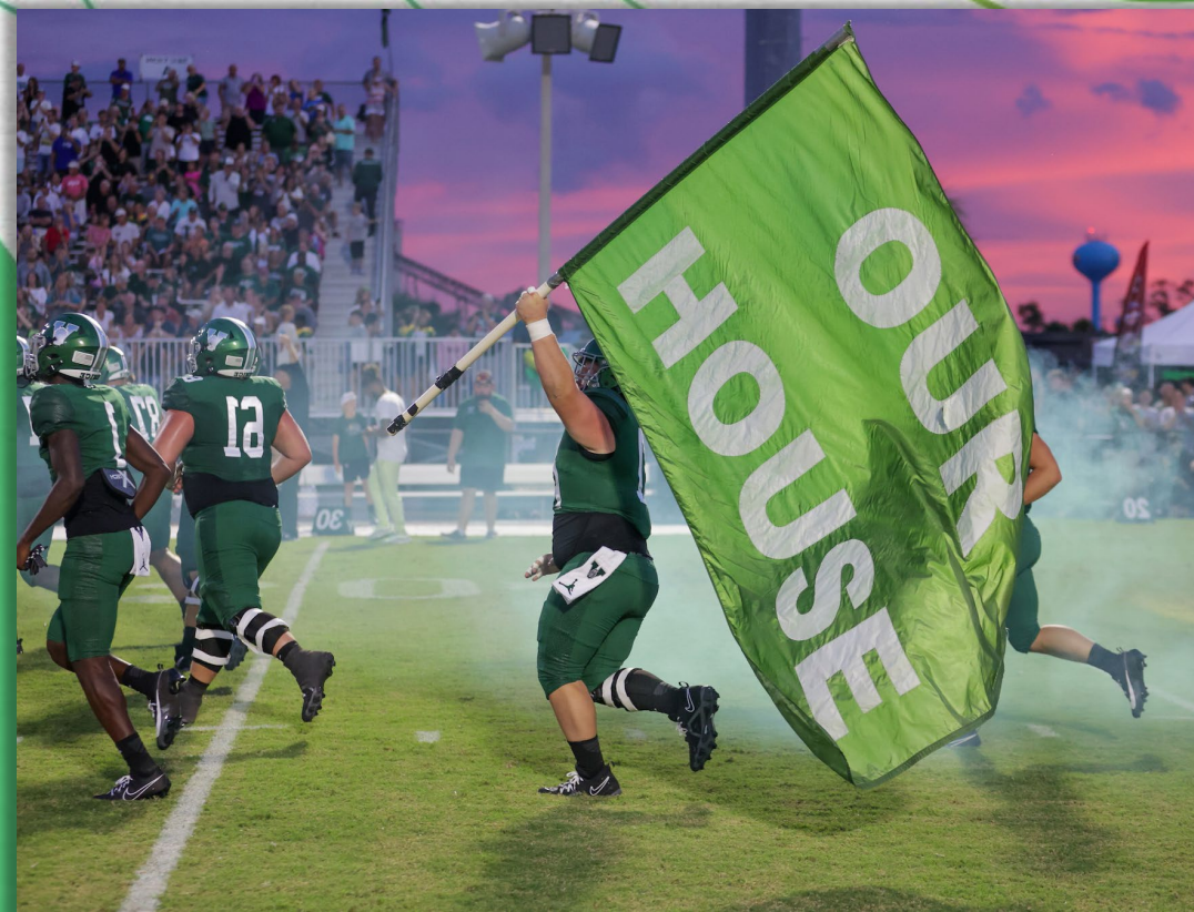
September 2023, "Our House", Venice High School, VHS Football Team.